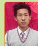
RINGPHAKHAI Agg. - 84.0%