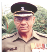
Lt Col P S Satsangi, VSM (Retd) (Oct. 23, 1929–April 01, 2005)