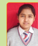
AKRITI Agg. - 90.75%